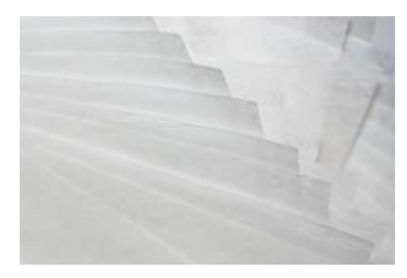
Helping the world get organized, one piece of paper at a time.